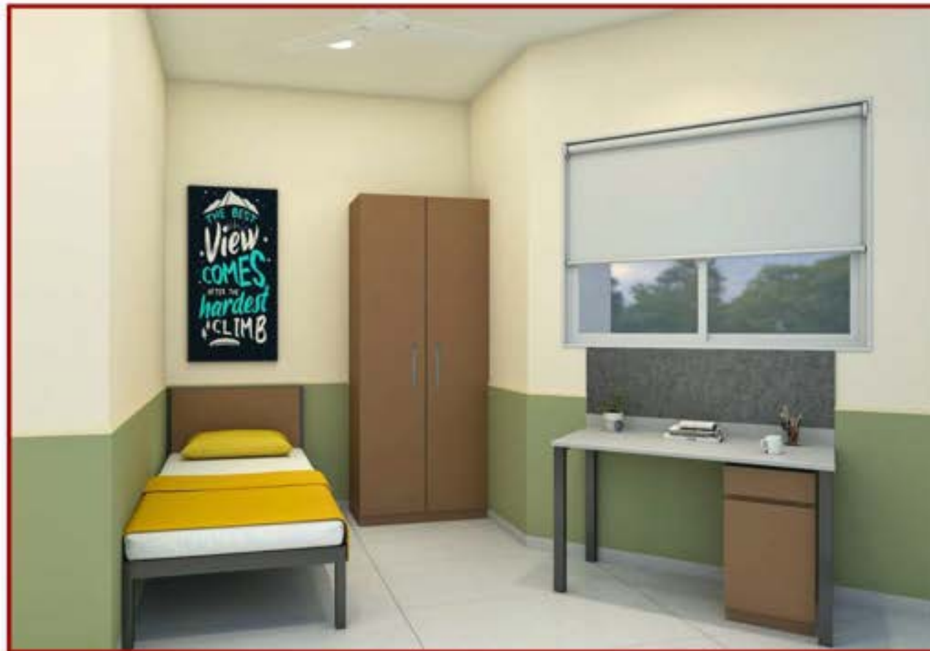
1 BEDROOM UNITS WITH 1 ATTACHED WASHROOM