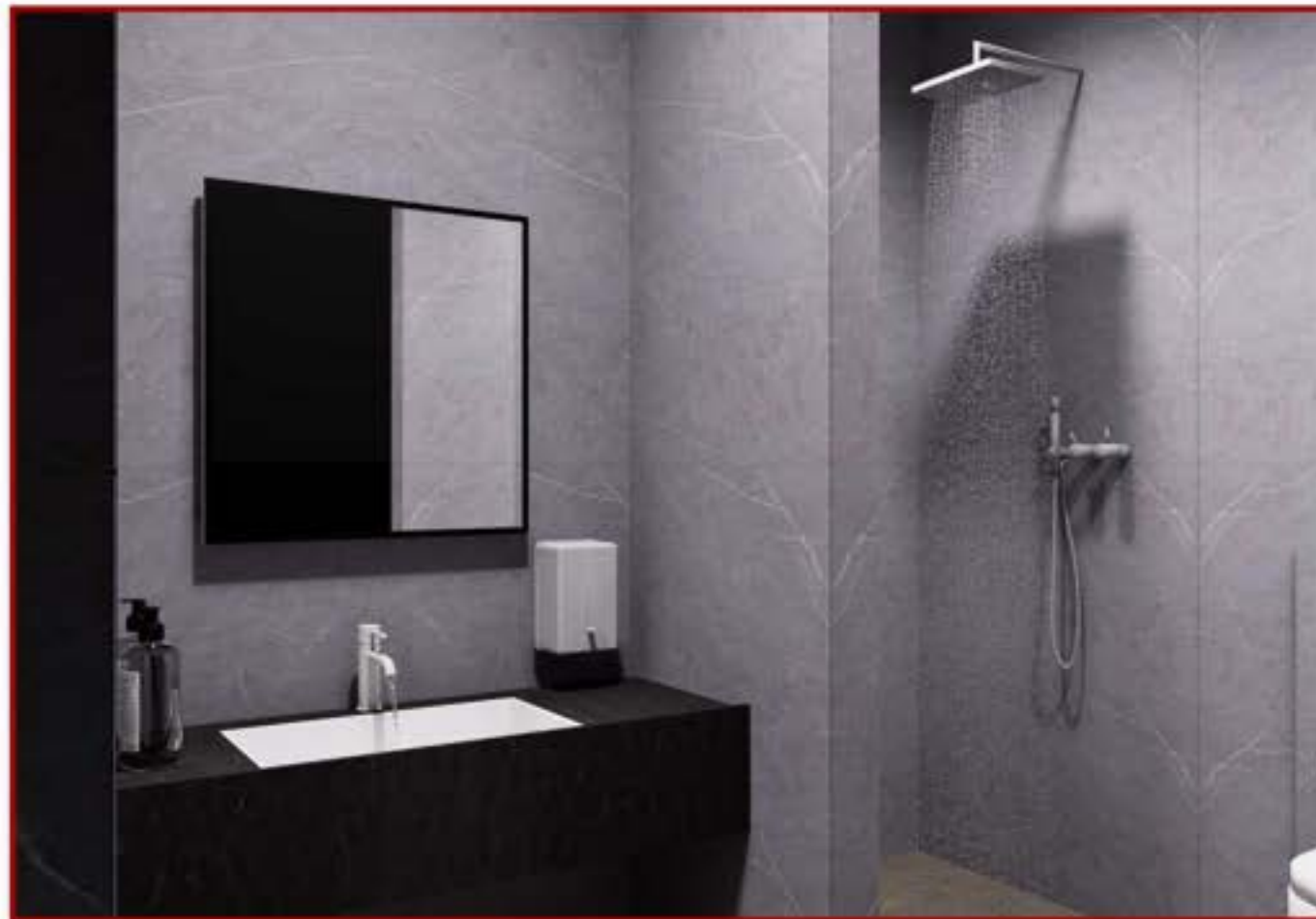
SINGLE BEDROOMS WITH ATTACHED WASHROOM