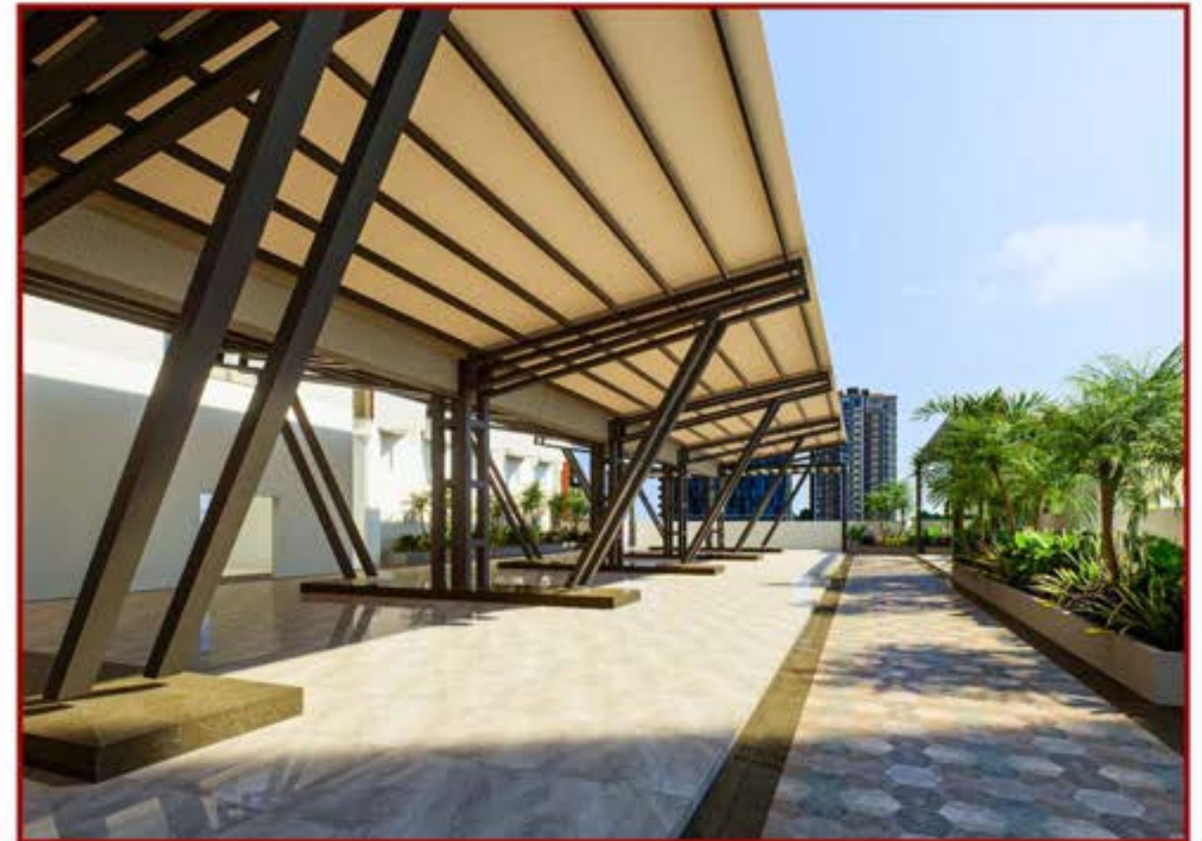
INSIDE THE D Y PATIL RESIDENCY