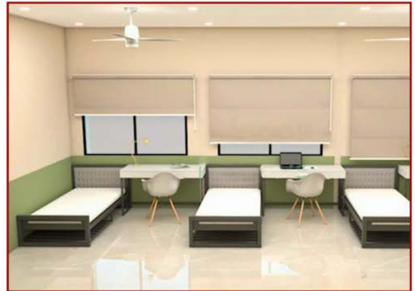
3 BEDROOM UNITS WITH 2 ATTACHED WASHROOMS