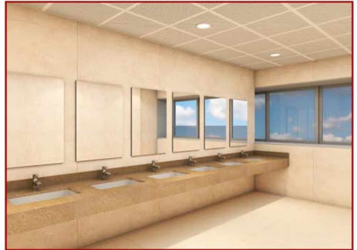
LAVISH RESTROOMS ATTACHED TO DINING AREA