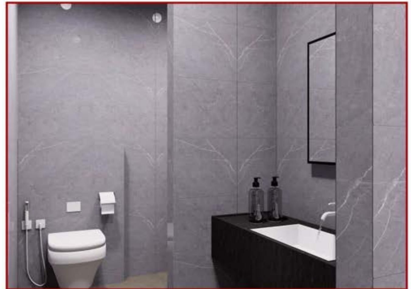
3 BEDDED ROOMS WITH 2 WASHROOMS & BASIN